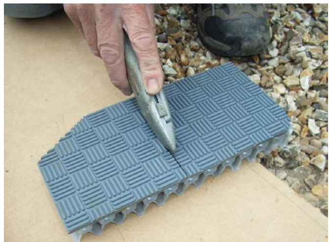
Use knife to cut SKYDEX top surface then turn material over to cut bottom surface