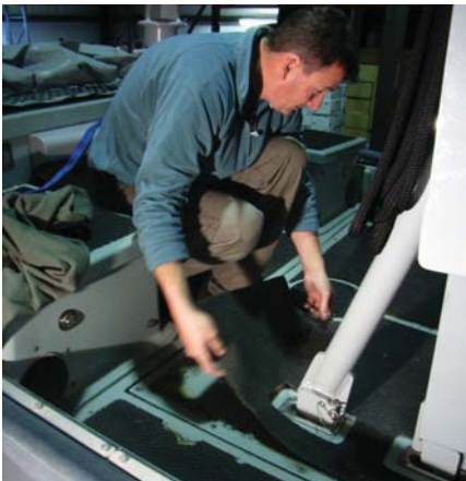
Remove existing material