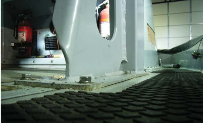
Deck fitting before SKYDEX