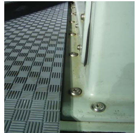
External console flange