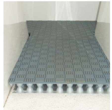
Shaping between seats