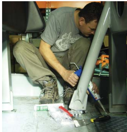
Glue down installation