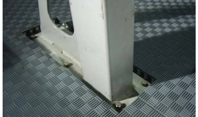
Deck fitting with SKYDEX