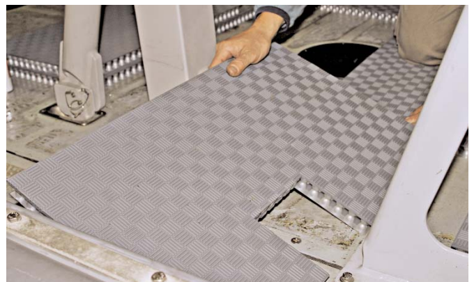
Simply cut SKYDEX panels to size