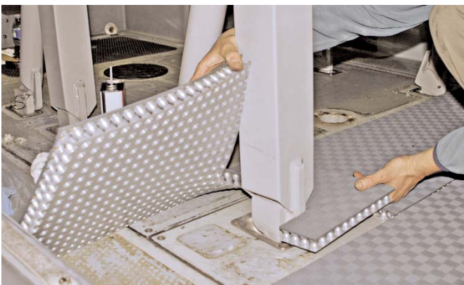
Cut SKYDEX panels around deck fittings