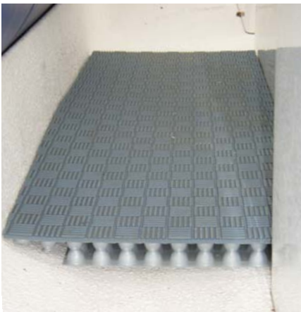
Tapering at deck edge