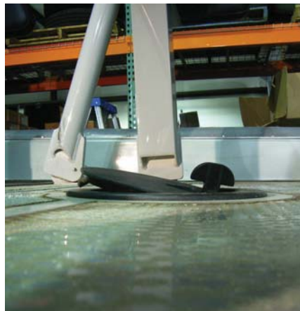
Mark inspection hatches